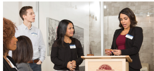
Table Topics. During Table Topics, all attendees have an opportunity to present one- to two-minute impromptu talks. This is often the most challenging and fun part of your meeting.

The order and length of these segments may differ from club to club. The length of a club meeting often determines the amount of time for each segment.