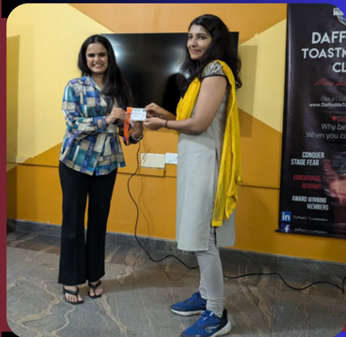
Best AUX TM JAZEENA