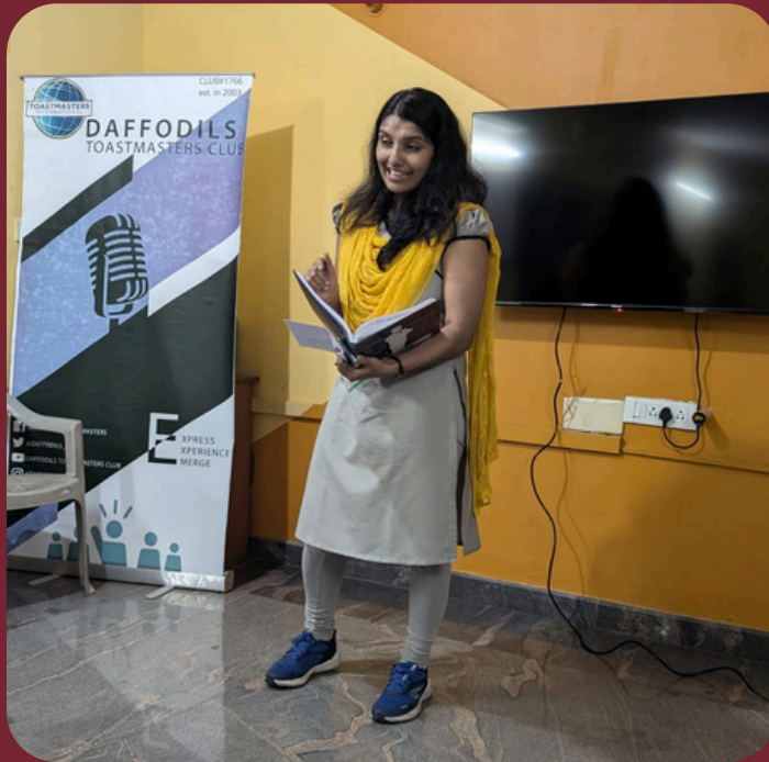
TIMER TM JAZEENA