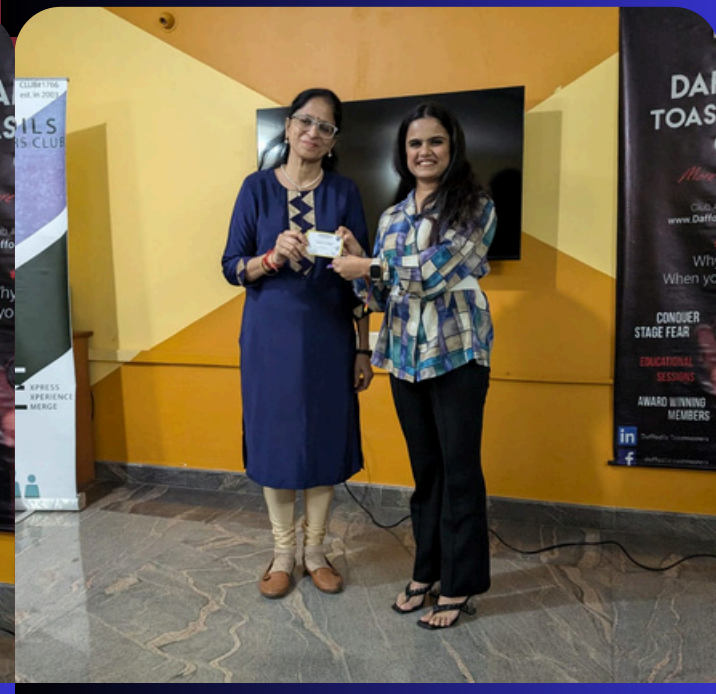
Best Listener TM MITA