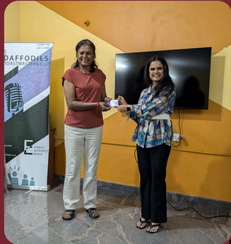
Best Main Role Taker DTM USHA