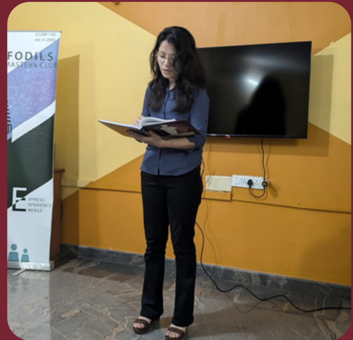
AH COUNTER TM KANAK