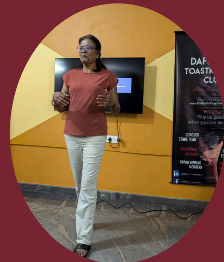
GE DTM USHA