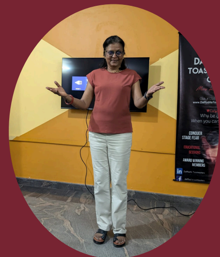
GE DTM USHA